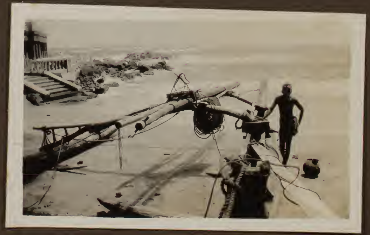
Colombo 16. 11. 28